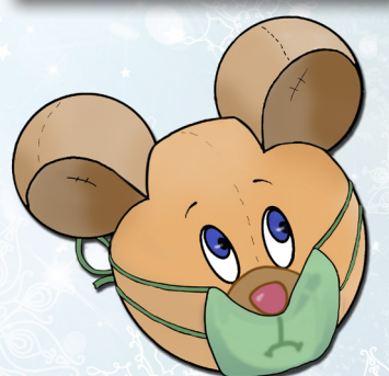
Under the nose doesn't work...